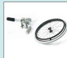
Drive wheel kit (22)