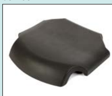
Full soft seat for plastic seat/comfort seat