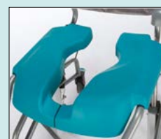
Seat comfort opening at rear, PU, green