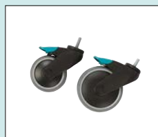
Castor with brake 100, 125 mm