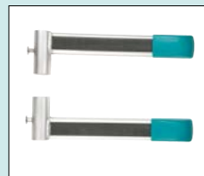
Widening kit (+5cm)