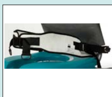
Waist strap/Thigh strap