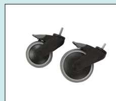
Directionally locking castor 100, 125 mm