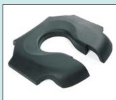
Seat, soft for plastic seat with hygiene opening, PU, black