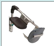
Amputation support/calf support, EASY