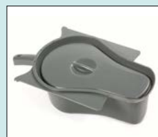
Waste container with lid/keyhole