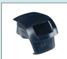
Plug for soft seat to create shower seat when used with 56-206