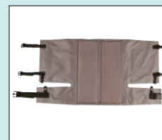
Comfort back strap