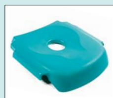
Shower seat, plastic/green