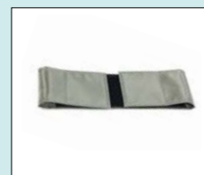
Calf support provides extra support for the lower leg