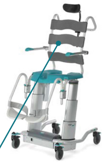
EASY SoftBack Flexi